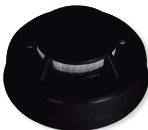
Other colors on request