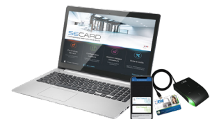
SECARD SECard configuration kit and SSCP® v1 & v2 and OSDPT™ protocols

* Our readers only read the / UID PICO1444-3B serial number of the iCLASS™ chip. They do not read the cryptographic protections iCLASS™ nor the / UID PICO 15693 serial number of HID Global.