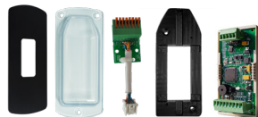
Decorative plate / Shield / TBLOCK / Spacers / Decoders...