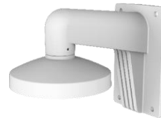
DS-1473ZJ-155 Wall Mount