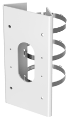
DS-1475ZJ-SUS Vertical Pole Mount