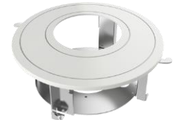
DS-1227ZJ-DM42 In-Ceiling Mount