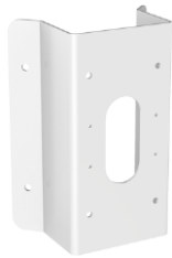
DS-1476ZJ-SUS Corner Mount