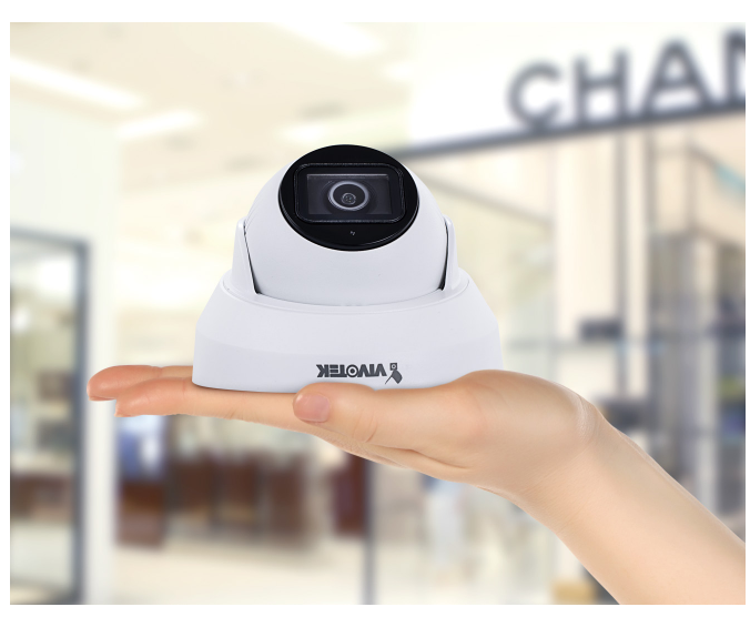
Easy Installation and Compact Size